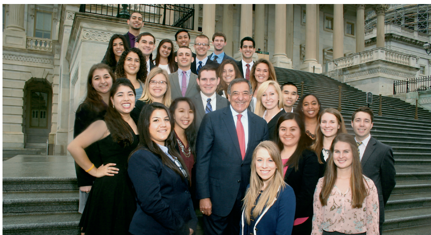
This year's interns met also with former defense secretary Leon Panetta.