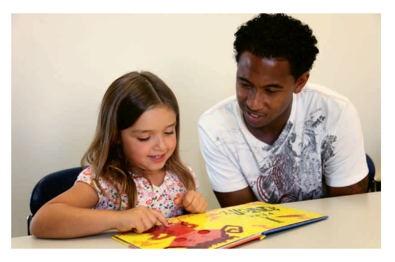
Reading with a student one-to-one is the key to success.

In addition to the expanding student volunteer program, Monterey County Reads recruits its volunteers from area colleges, businesses, military installations, faith groups and community organizations. Additional volunteers and organizations are encouraged to get involved.