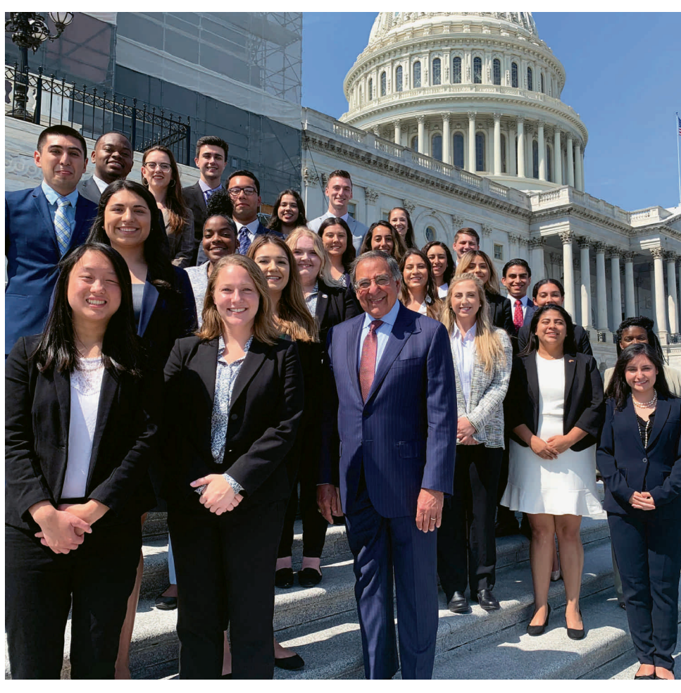
2019 Congressional interns with Secretary Panetta at the U.S. Capitol.

Panetta interns get an in-depth education in the legislative process, starting with a twoweek orientation course at the Institute's Monterey Bay headquarters, where they interact with members of Congress, congressional staff, political journalists and other Washington veterans.