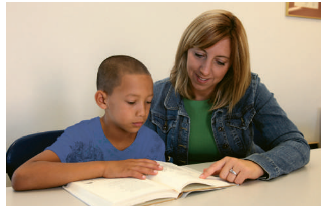
Monterey County Reads has helped thousands of children learn the joy of reading.