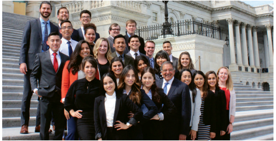
This fall's class of interns join Secretary Panetta on the U.S. Capitol steps.

However, after an in-depth education starting with a two-week orientation and training course at the Institute's Monterey Bay headquarters and eleven weeks of service on Capitol Hill, interns discovered that they can indeed be part of the national political process.