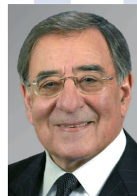
Leon Panetta: "The American Dream is alive and well."

The Panetta Institute values the principles of good leadership and an informed citizenry, even during this time of challenge. While the Institute has curtailed its services in order to ensure the safety of those we serve as well as